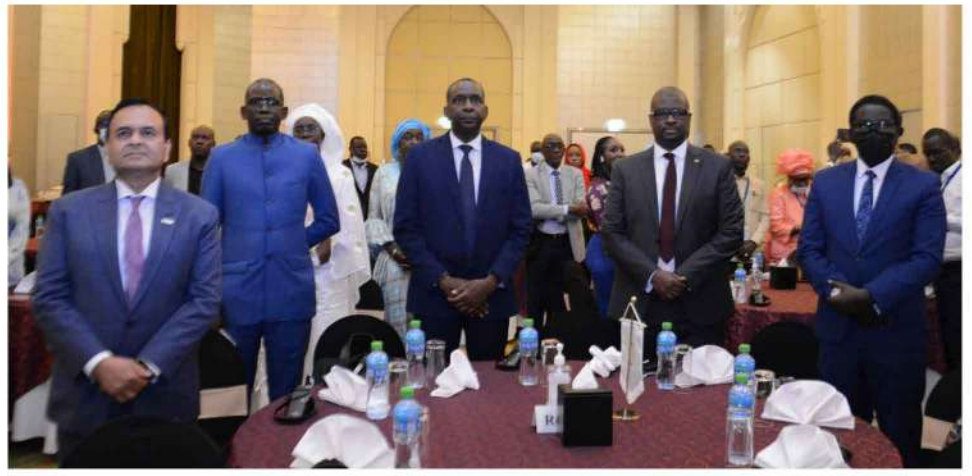
CEO Clubs Network in partnership with Senegal EXPO 2020 hosted "Investment Opportunities in the Digital Economy and Telecommunications Sector in Senegal' on 16 March 2022.

We had a series of keynote speeches and presentations from the Ministry and VIP delegates from Senegal telling us more about the business opportunities in Digital Economy and Telecommunications Sector in Senegal.